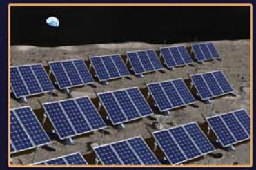
Solar panels will collect valuable energy for future outposts.

With daylight lasting 14 Earth days, sunlight can be collected, stored, and used to power the outpost, providing energy for lighting, instruments, and life support. Crater rims at the Moon's polar regions receive sunlight for even longer periods.