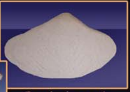
Raw titanium powder.

Iron and titanium harvested from basalts of the maria, and aluminum from lunar highland rocks, can be manufactured into materials for buildings, rovers, and solar panels.