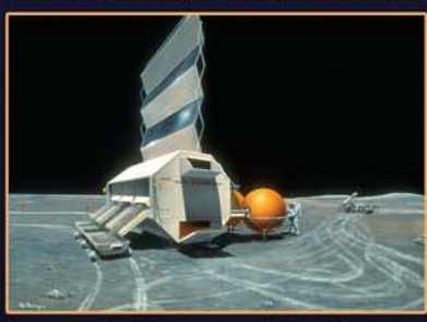
Future processing plants on the Moon's surface will extract oxygen from the lunar regolith.

Countless impactors have pulverized the Moon's rock and created a layer of lunar "soil" — regolith — on the surface. Regolith can be a useful resource! Astronauts may extract oxygen from regolith to make breathable air. They may cover lunar habitats in regolith to protect themselves from dangerous solar and space radiation. Heating regolith fuses its particles; future outposts may have roads and building bricks made of fused regolith.