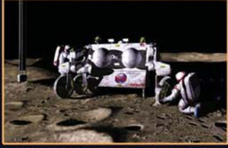
If water ice is found at the Moon's poles, astronauts may use robots to help mine it.

Data from spacecraft missions suggest that water ice may exist at the Moon's poles. Because the poles are not tilted toward the Sun, sunlight never reaches the bottom of deep craters. They are permanently dark and very, very cold. Water ice, perhaps delivered by comets, may be trapped in the craters. Water is an important resource for future outposts not only for drinking, but also because hydrogen and oxygen, the elements that make up water, can be separated and used to make spacecraft fuel. The oxygen can also be used to make breathable air.